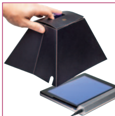
Supplied with a flatpack hood