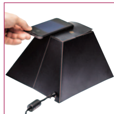
Use your phone to capture an image